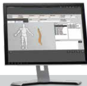
Image Suite V4 Software