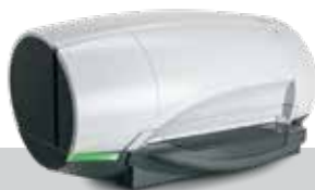
Vita Flex CR System