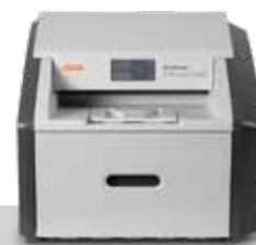
DRYVIEW 5700 Laser Imager